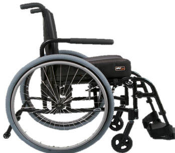
Quickie QXi, Ultra Lightweight Adjustable Folding Wheelchair