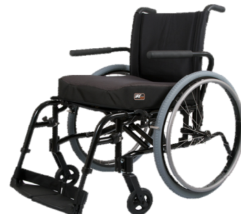
Quickie QXi featuring the Jay ION™ cushion